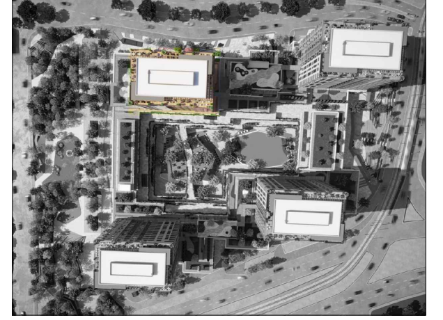
LONDRA BLOK 4. KAT